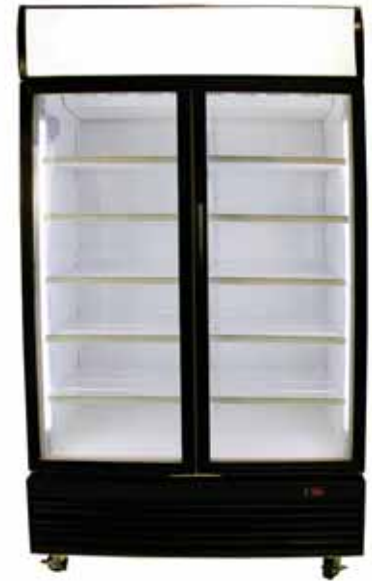
Glass Door Chiller W/ Lightbox 1000L LED Black GM1000LB LED