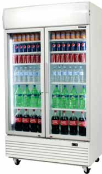
Glass Door Chiller W/ Lightbox 1000L LED White GM1000LW LED