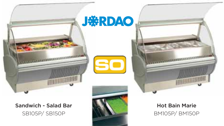
Sandwich - Salad Bar SB105P/ SB150P