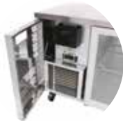
Removable refrigeration cassette