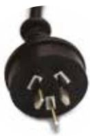
10 Amp power

Compact, robust one door refrigerator and freezer. Ideal for small kitchens and noise sensitive areas.