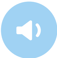
Low noise design